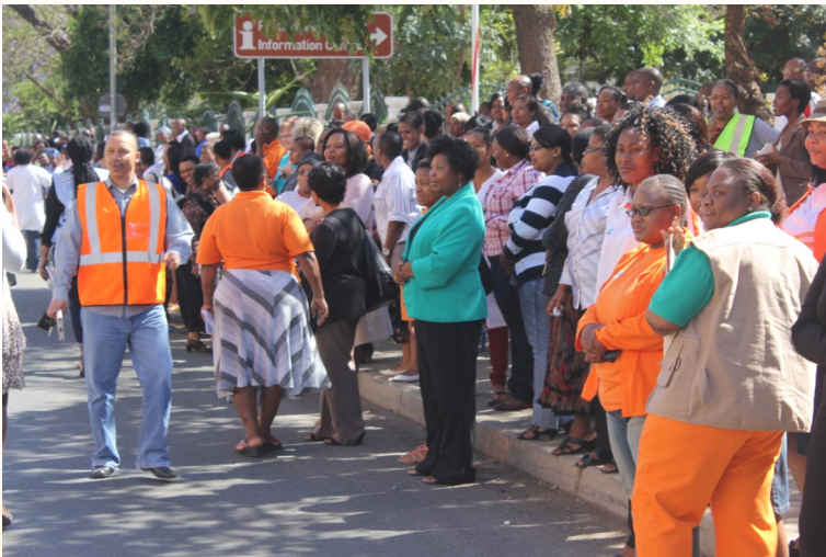
LDPW Staff Members during the Evacuation Drill exercise