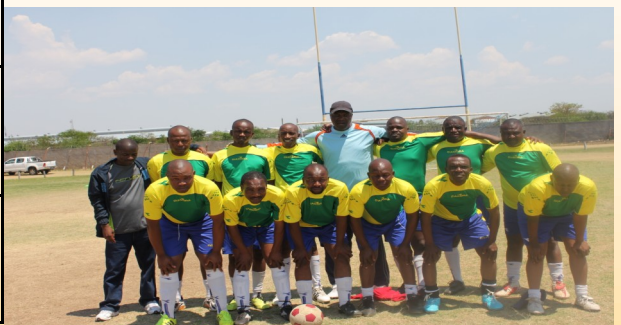
LDPW Men Soccer Team