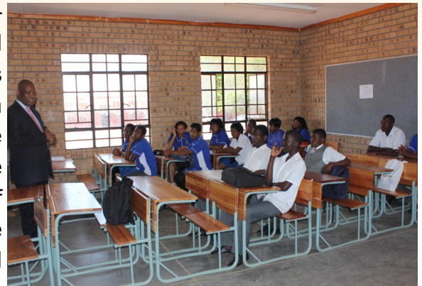
MEC , motivating grade 12 pupil ahead of exams