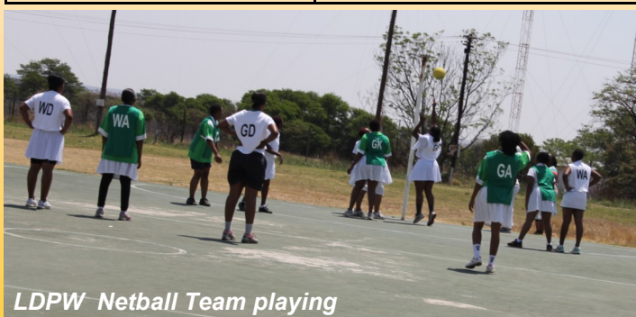
LDPW Netball Team playing