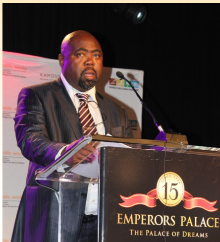
Minister for Public Works T.W. Nxesi during Kamoso Awards

The Minister for Public Works T.W. Nxesi, held the 2012/13 Expanded Public Works Programme (EPWP) Kamoso Awards ceremony on the 17 th October 2013 at Emperors Palace in Gauteng. Through these annual ministerial