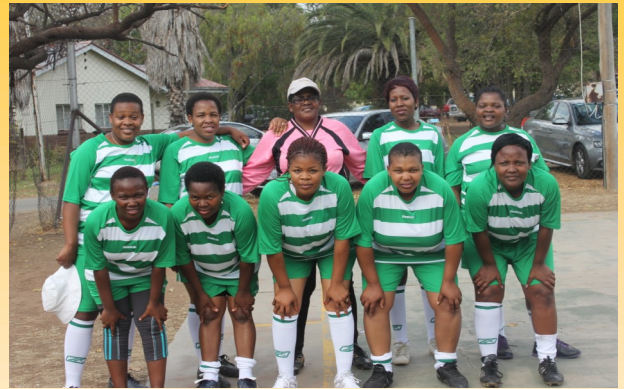
LDPW Ladies Soccer Team

Public Works as part of Provincial department took part during the Public Service Sport, the departments were Premiers Office, Statistic South Africa, Sports, Health, Agriculture, Economic Development, Local Government and Housing, SAPS, SANDF, Rural Development, Education, Treasury, Correctional Service and Road and Transport, Old Mutual, Virgin Active, Avbob and MGM Motors. Sport activities for the day were volley ball, netball, soccer, tug of war (men and women), running, ladies soccer and aerobics.