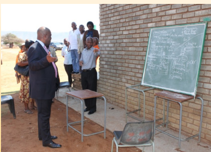
Maths teacher at Makgwale High showing an under tree classroom to the MEC