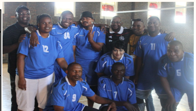
LDPW Volley Ball Team